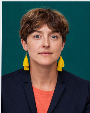
Mission lead for Future Technologies & Democracies The Democratic Society