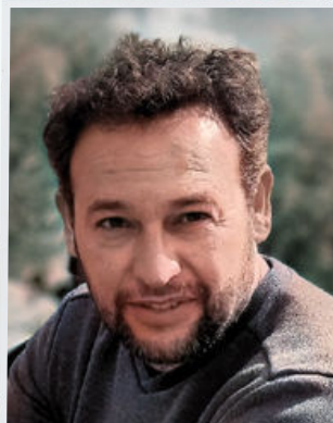
Director Europe MédiaLab